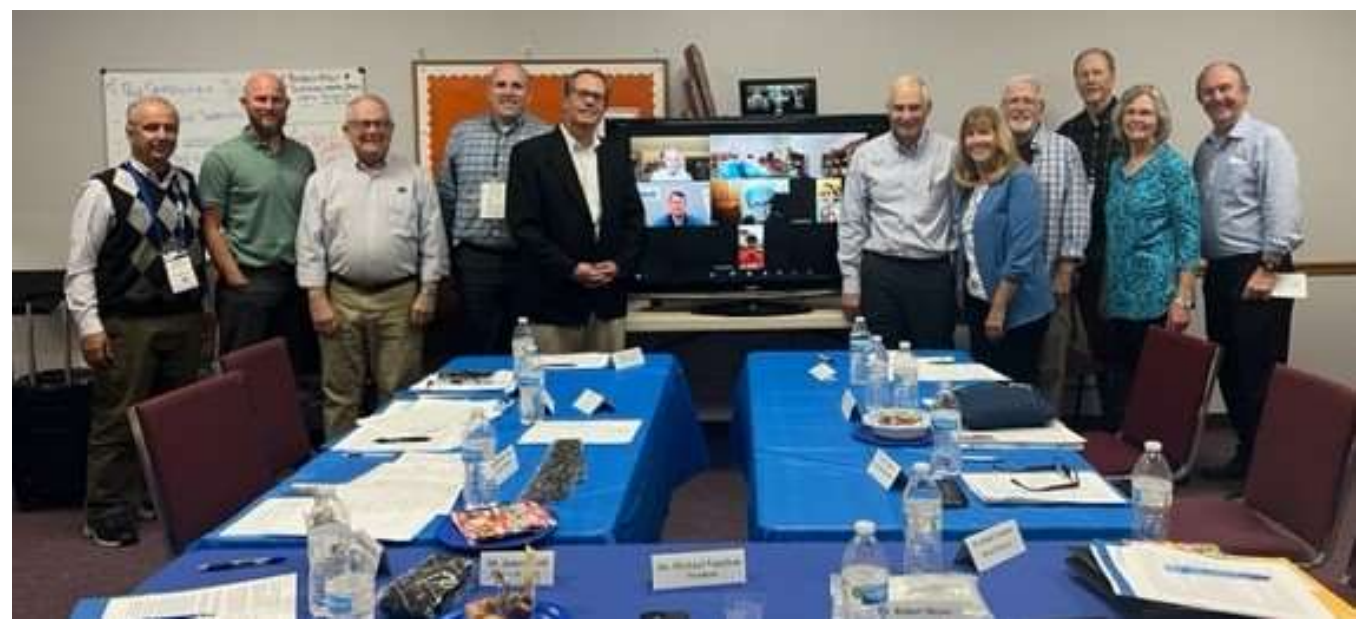
The CDS Board Meeting Photo with Zoom participants shown on the TV

The CDS held its yearly, in-person Board Meeting and Mission Banquet on Thursday, October 5, 2023 at the Central Parkway Baptist Church in Orlando, Florida. The CDS also ran an exhibit booth at the ADA convention from Thursday-Saturday. The following is a summary of the Board Meeting.