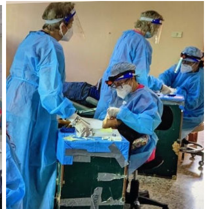
Ukraine, Praising the Lord 12 Miles from the Front