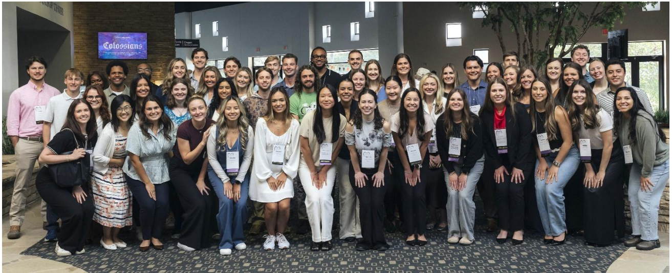
GCDC Students at Last Year's Conference

3. The CDS encouraged members to participate and to get the word out to dental professionals, students, and others about the third Great Commission Dental Conference (GCDC) on September 11-12 in Dallas, Texas at the Bent Tree Fellowship Church (where it was held last year). This year we are planning on having 32 breakout sessions to include Christian mission plenary speakers, preaching, music, and eight hours of CE available. Register for next year's GCDC at: www.cmda.org/gcdc