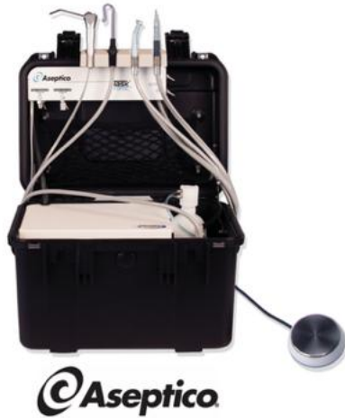
ADU-12DCE Task Force Deluxe Portable Pneumatic Dental System

The newly designed Task Force Deluxe Portable Dental Unit