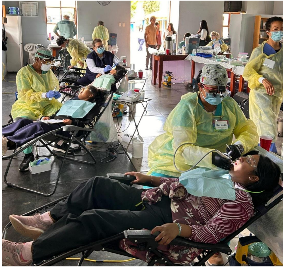
Picture of Starfish Ministry in Action in Mexico