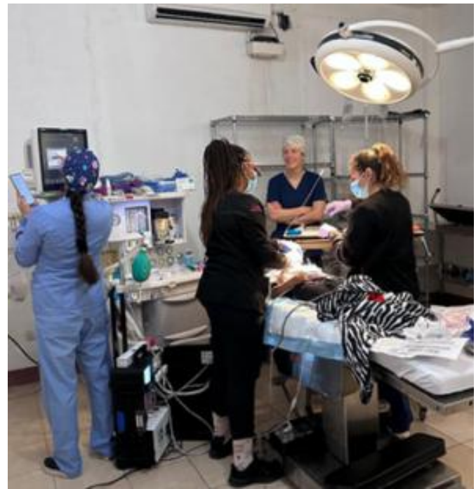
Operating Rooms in San Raymundo Clinic Treating Local Children

Remember to put on your calendar, the Great Commission Dental Conference (GCDC) on September 12-13 at the Bent Tree Fellowship Church near Dallas, Texas. This Christian, dental mission conference connects dentists, hygienists, students, and others from around the world who are interested in using dentistry as an evangelistic outreach to serve others.