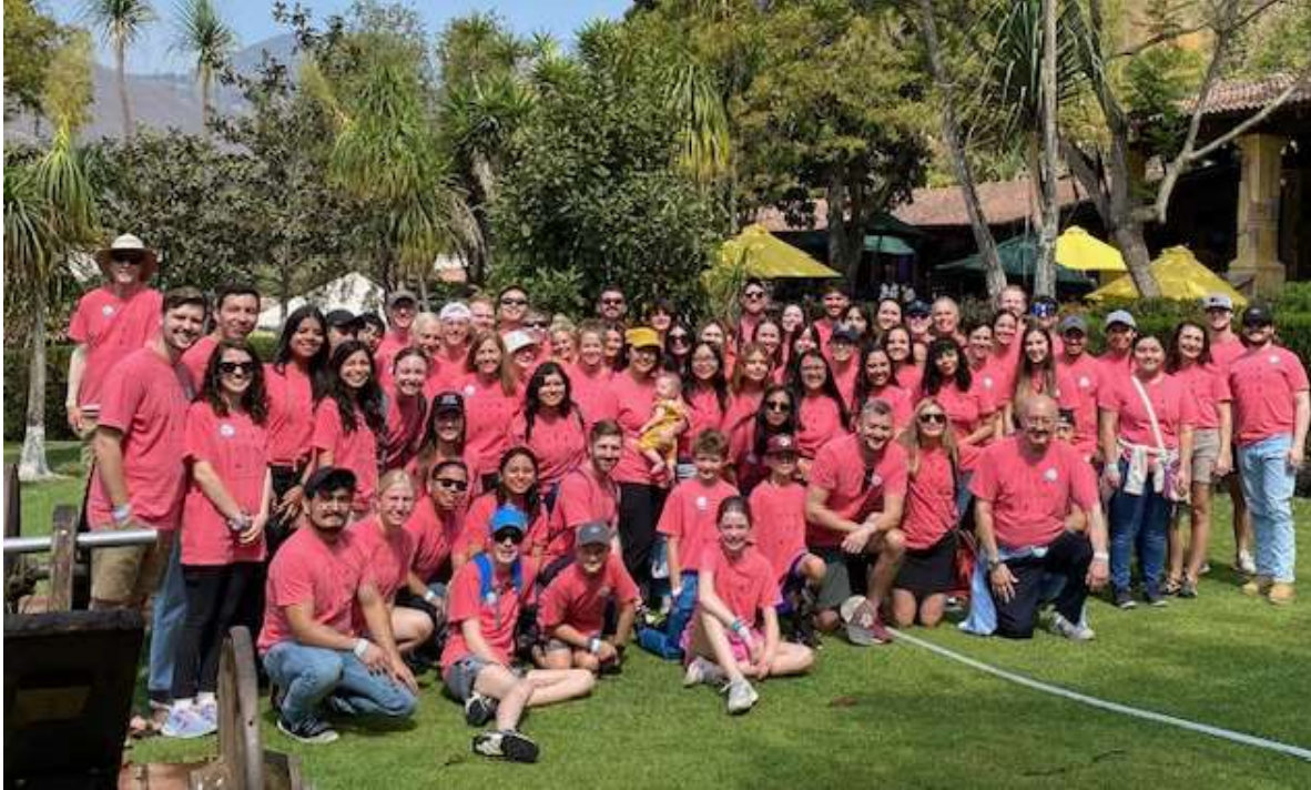
The Guatemalan team touring a coffee plantation while enjoying a day off.