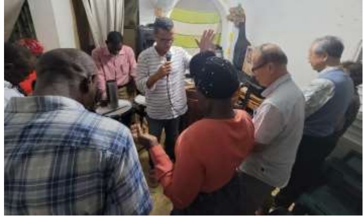
Always Cover the Teams with Prayer