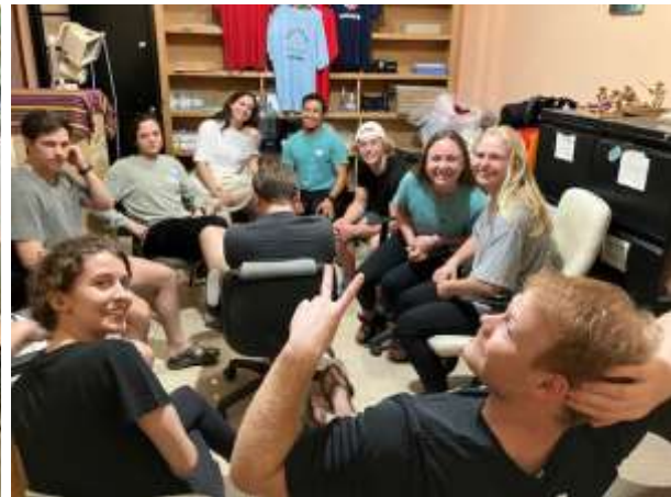
The Students Bonding After Hours