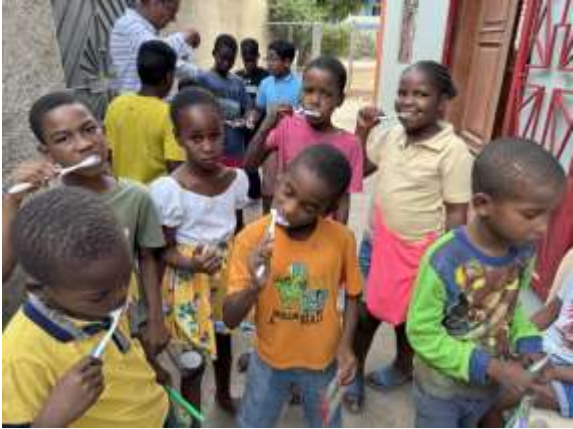
Oral Hygiene: So Important