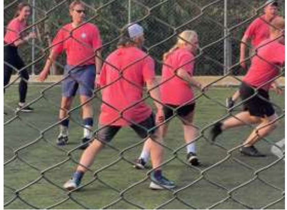
Many Enjoyed Playing Soccer