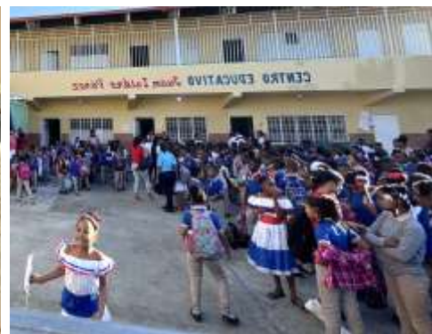
The CDS has NOMADS Work with What You Have The Joyful Crowd

Our plan was adjusted as our dental instruments and supplies were confiscated at customs. However, we were able to bring the Aseptico unit and Nomad unit into the country. As pastors were preaching the gospel at the church services with Bible studies, we began our dental work, seeing local people for oral examinations and dental radiographs, hoping to provide dental care as soon as we got our baggage back out of customs. Since our toothbrushes and toothpaste were held up at customs, we went out and purchased toothbrushes and toothpaste and handed them out to the people that we