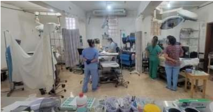
Treating Children in the Guatemala OR