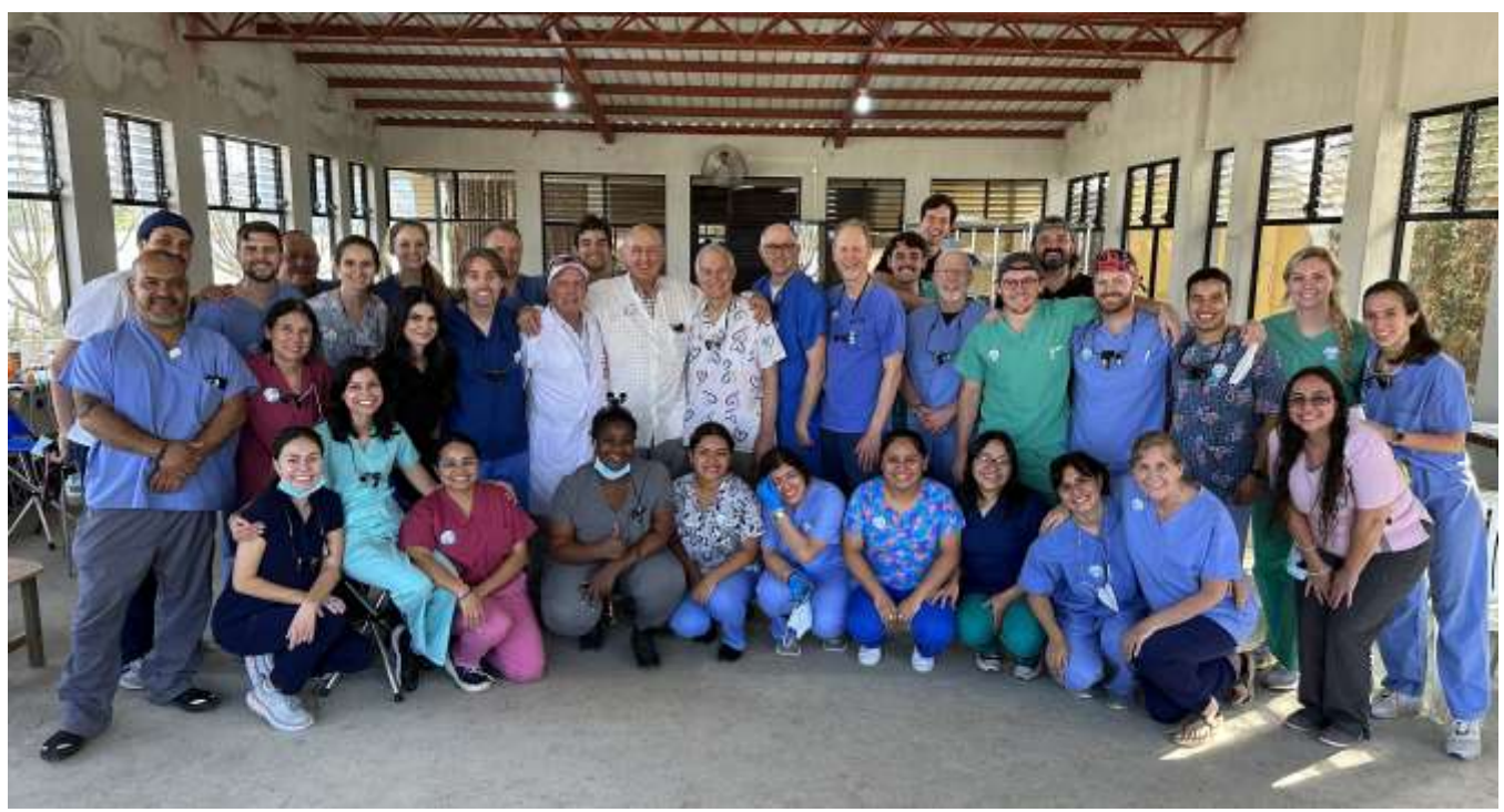
The 2023 Guatemalan Dental Student Trip Team in San Raymundo