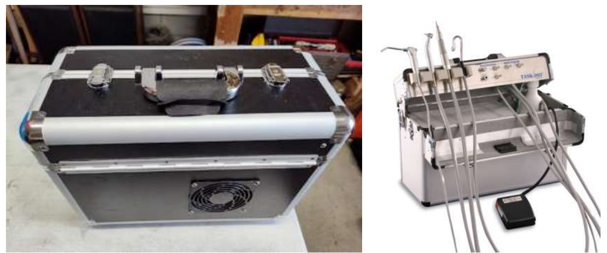
The same dependable, simple to use, Task Force Deluxe unit in a new case.

Aseptico, who provides the Task Force Deluxe, self-contained dental operating unit which the CDS loans out for dental mission trips, has recently changed the case to make it more dependable.