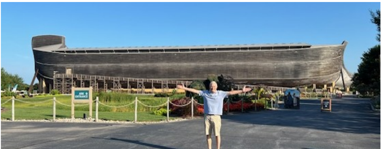
Recreation of Noah's Ark at the Ark Encounter

The CDS has been attending numerous Dental Convention Exhibit booths to encourage dental professionals, presenting the Gospel message, and inspiring others toward using dentistry to help under-resourced people. Most recently, CDS members exhibited and spoke at the National Dental Convention in Kansas City in July and at the Kentucky Dental Convention in Louisville last week. The CDS will have a booth at the GCDC on Sept. 12-13, at the Ohio Dental Conference on Sept. 25-27, and at the ADA Convention in Washington DC on Oct. 23-25.