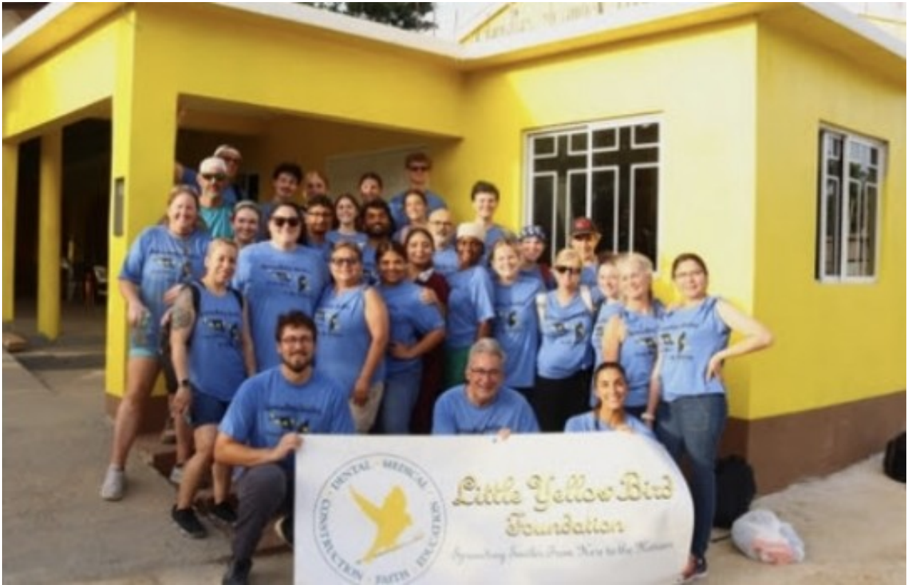
Little Yellow Bird Foundation team working in the Helping Hands Dental Clinic in Jamaica.