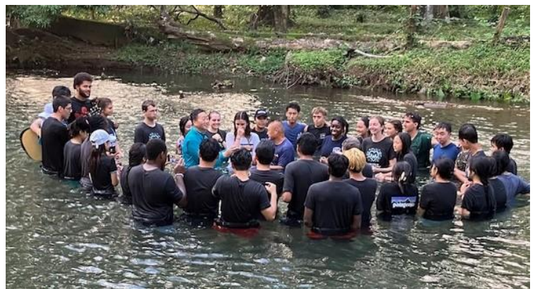
Baptism of Students at the End of the Mission