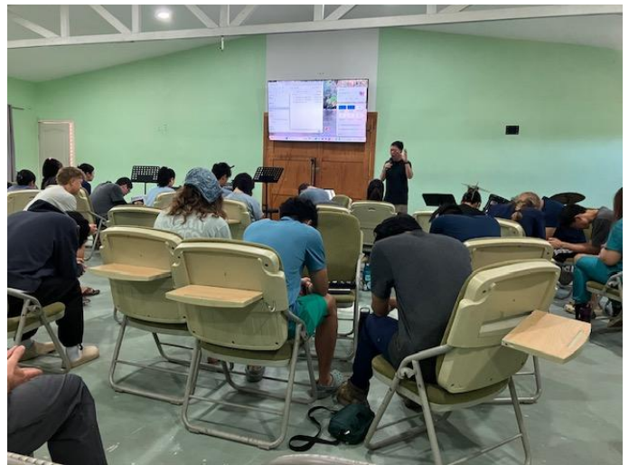
Student Team performing Evangelistic Song and Dance Students Praying