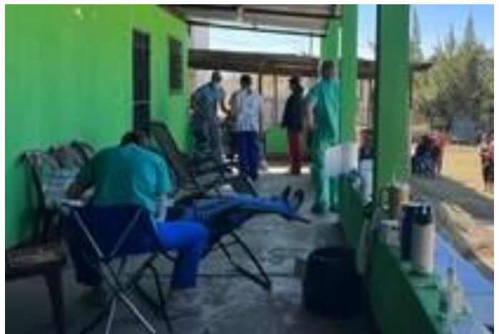
Clinic in a More Remote Area

We worked the first two days in the clinic all together. The third day, we split up the team and half stayed at the clinic while the other half went about an hour up the road to a more remote area. It was a wonderful experience all around. As is often the case, everyone talked about how much more the trip impacted them than what we were able to do clinically. Not every one of our staff on the trip was a Christian, but they got a dose of the Gospel in such a unique way on a daily basis.”