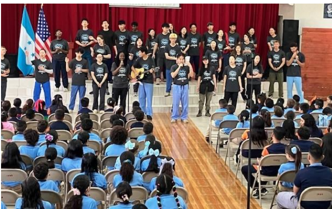
Students Performing for the School

This mission was challenging physically, yet was probably the most spiritual, uplifting, heartwarming, and encouraging mission trip we have ever been on. No one ever complained, and all were fully engaged throughout the trip. The quality of the Christian students, their preparation for the trip beforehand at their local school chapters, the discipleship emphasis, and mentorship towards Christian living and service were remarkable. GMMA has gone to Honduras at least 20 times, and this is only one type of trip they conduct. They currently train and serve at ten different mission sites each year. Visit www.gmma7.org for schedules or missions@gmma7.org for questions. GMMA has an amazing mission conference every other year and will be held this year on June 26-27 in Southern California: https://conference.gmma.kingdompla.net .