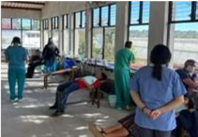
The Guatemalan Clinic in San Raymundo