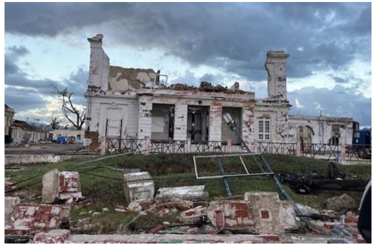
Hurricane Melissa Devastation at the Clinic Location and in Black River