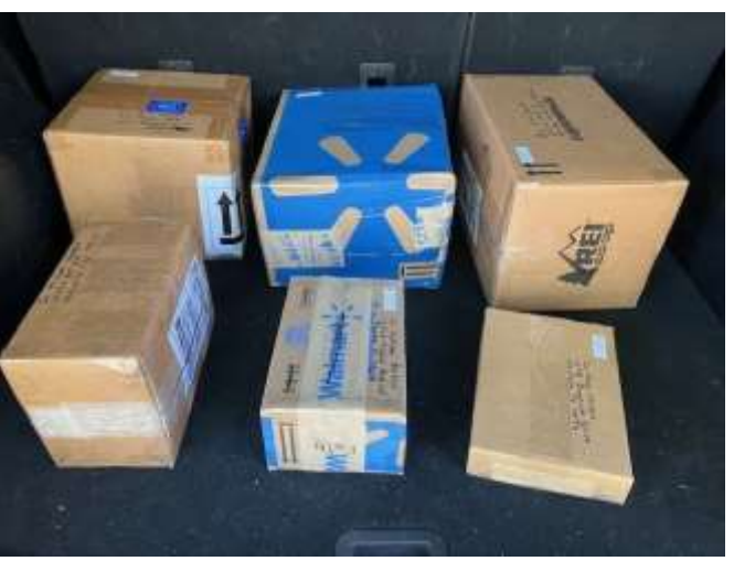
Boxes of Instruments for Mission Work