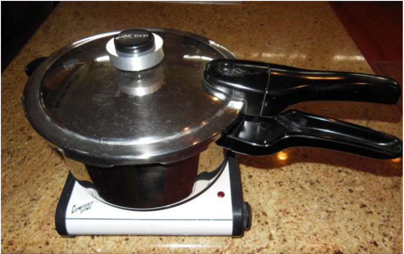
A four-quart, stainless steel, Presto Pressure Pot #01341 on an electric heater, with a CDS aluminum ring on the black regulator