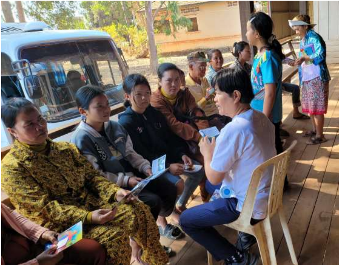
Four Evangelists Shared the Gospel After Treatments.

medial missionary who usually accompanies us from Siempang village, a three-hour drive from the provincial capital Stungtreng, said that the new government, run by the son of Prime Minister Hunsen, has instituted strong restrictions on evangelical activities.