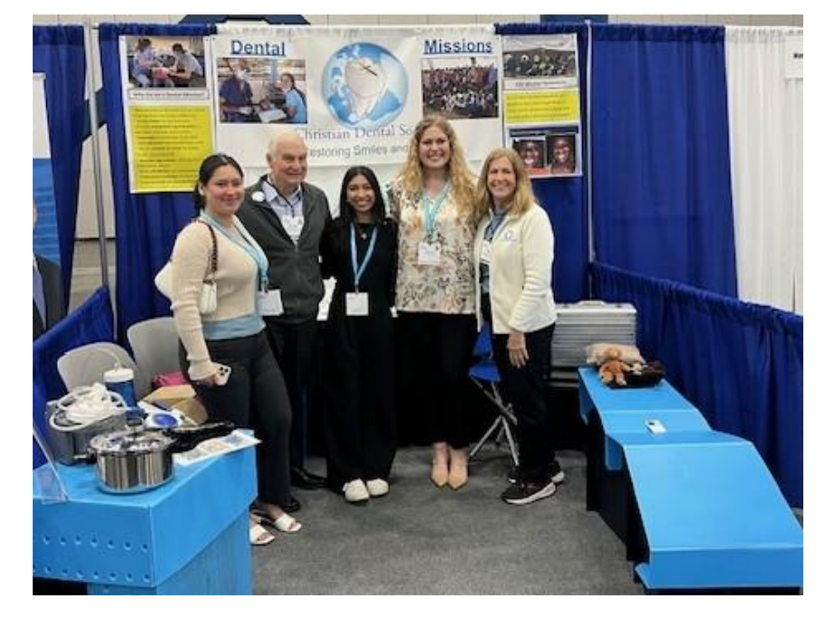
An Exhibit Booth in Houston (Students and Assistant from Guatemalan Trip)

The CDS continues to exhibit and speak at dental conferences to share the joy of service, present the gospel message, and open opportunities for service. This year the CDS has already exhibited in Denver and Boston. In Chicago, the CDS and CMDA joined forces and shared a booth. The CDS exhibited at the Hinman in Atlanta on March 20-22, Star of the South in Houston on March 27-29, and the Remedy East Conference (for the first time) at Liberty University on April 11-12 (where several CDS members spoke). Upcoming conventions where the CDS will have exhibit booths include: Pacific NW in Seattle on May 8-10 where CDS members will be speaking, Texas Dental Association meeting in San Antonio on May 8-10, and the California Dental Association meeting in Anaheim on May 15-17. The CDS is exhibiting and speaking (for the first time) at the National Dental Association in Kansas City on July 11-12 and the Kentucky Convention in Louisville on August 14-16.