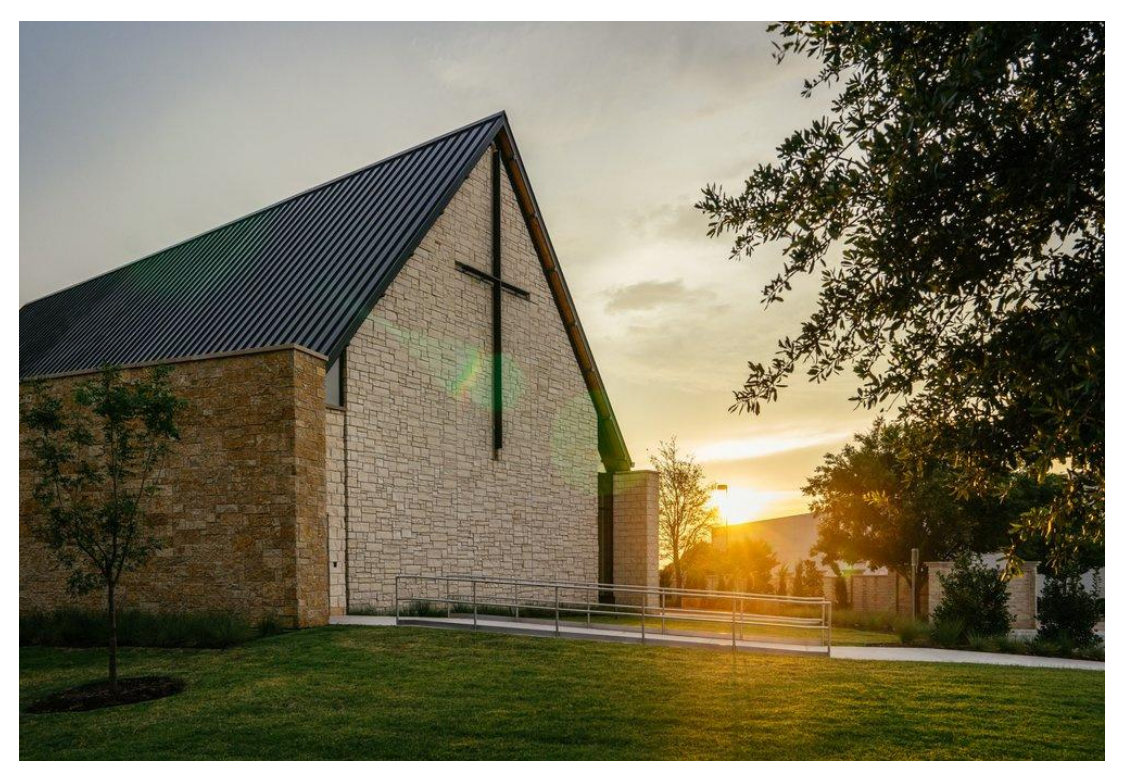
Bent Tree Bible Fellowship Church near Dallas, Texas

encouraging topics. The GCDC will have a professional worship leader, missional exhibit booths, fascinating plenary topics, and great food served on site.