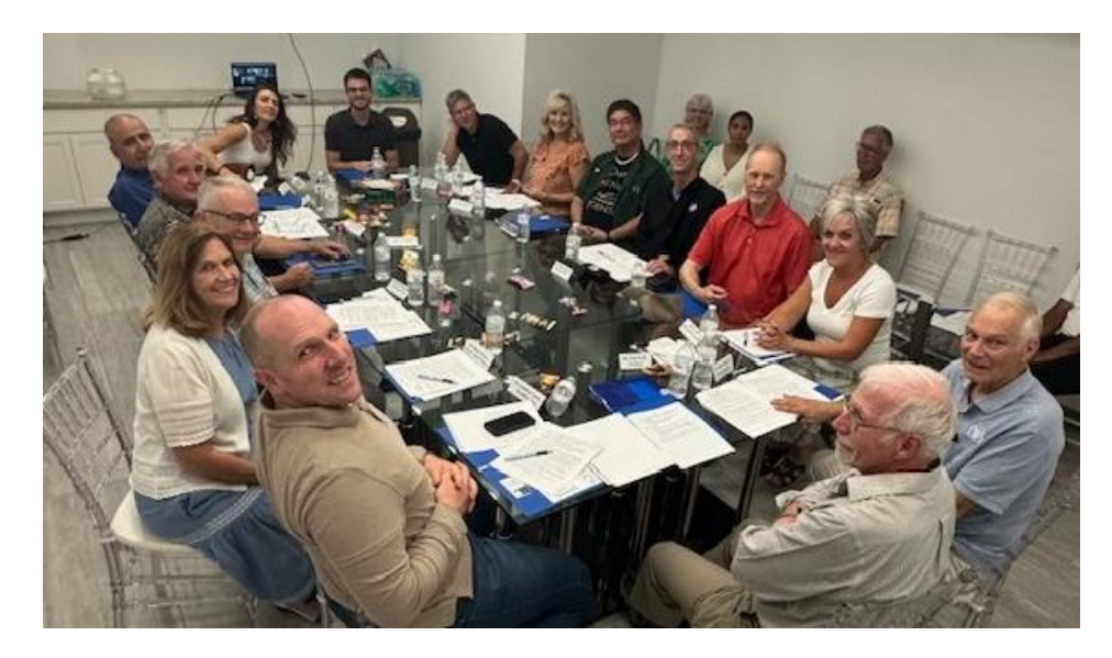
CDS Board Meeting in October 2024

The CDS continues to exhibit and speak at dental conferences to share the joy of service, present the gospel message, and open opportunities for service. This year the CDS has already exhibited in Denver and Boston. In Chicago, the CDS and CMDA joined forces and shared a booth. The CDS exhibited at the Hinman in Atlanta on March 20-22, Star of the South in Houston on March 27-29, and the Remedy East Conference (for the first time) at Liberty University on April 11-12 (where several CDS members spoke). Upcoming conventions where the CDS will have exhibit booths include: Pacific NW in Seattle on May 8-10 where CDS members will be speaking, Texas Dental Association meeting in San Antonio on May 8-10, and the California Dental Association meeting in Anaheim on May 15-17. The CDS is exhibiting and speaking (for the first time) at the National Dental Association in Kansas City on July 11-12 and the Kentucky Convention in Louisville on August 14-16.