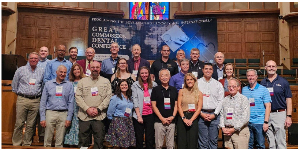
A powerful group of Christian missionary speakers

225 registered for the GCDC with 25 speakers presenting on a wide range of Christian mission topics, including 40 dental students from numerous schools attending.