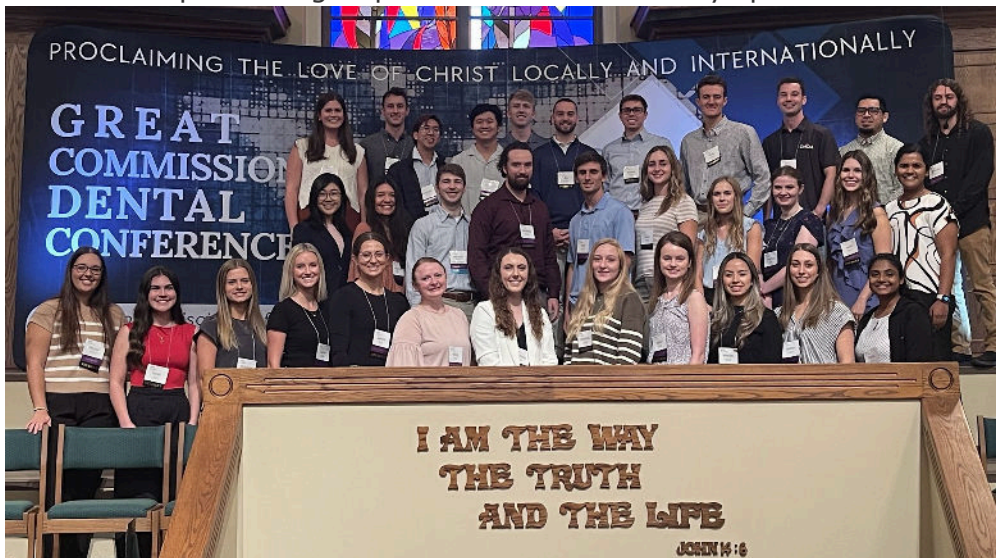
Dental students from across the country