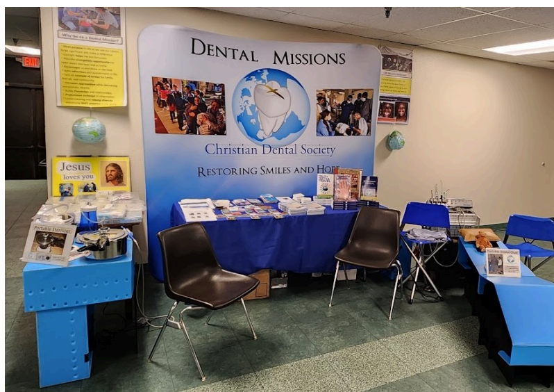
The CDS booth exhibit at the GCDC